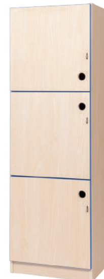
Small Triple Locker