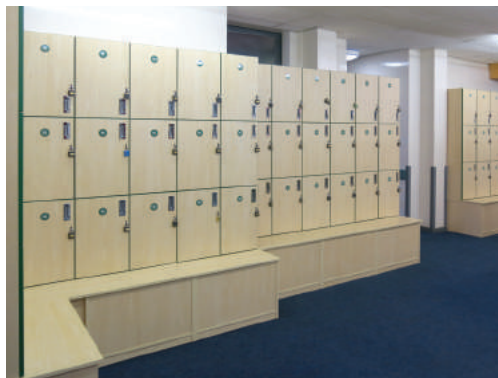
King James' School, Knaresborough

Therefore, we collaborate with teachers to create comfortable classrooms that promote a sense of well-being for students.