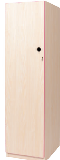
Single Tall Locker