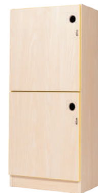
Small Double Locker